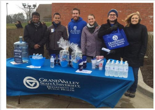
Students at Grand Valley State University in Allendale, Michigan, brave cold temperatures to host an "Amazing Race" style health challenge on campus.