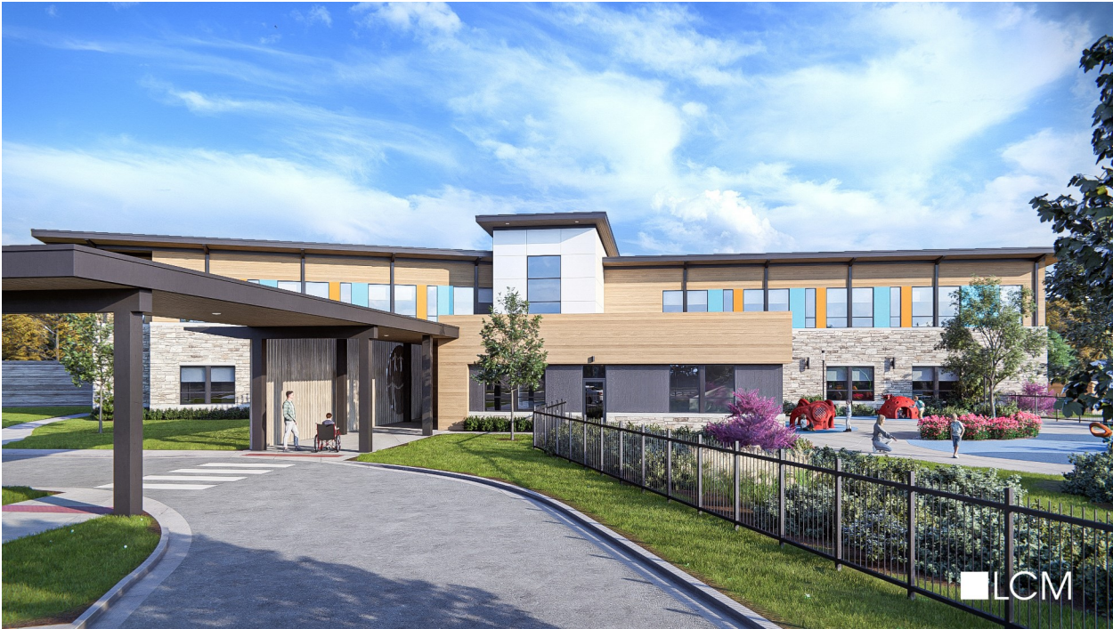
The Phillip J. Rock Center and School Glen Ellyn, Illinois 759-011-007