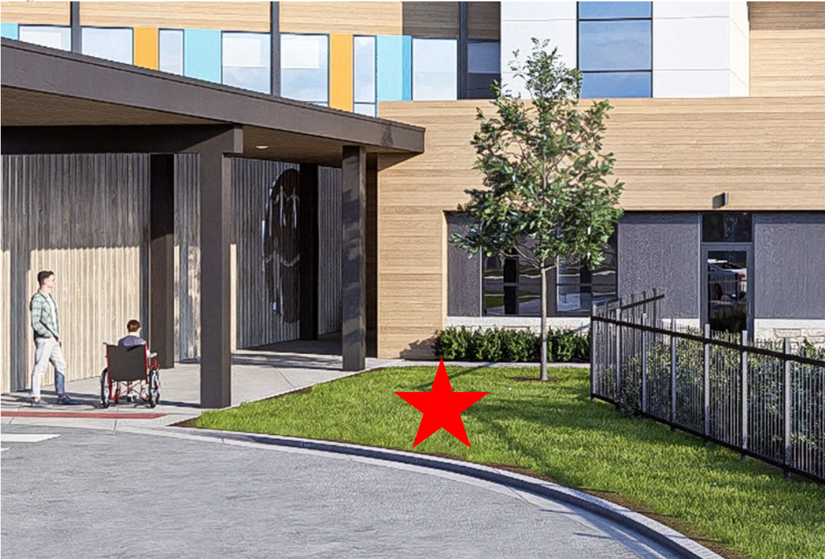
The Phillip J. Rock Center and School Glen Ellyn, Illinois 759-011-007