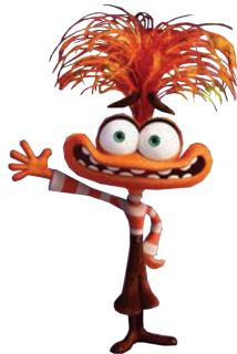
6. Anxiety _____