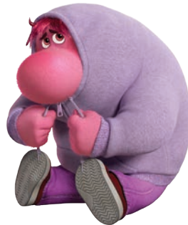
7. Embarrassment _____