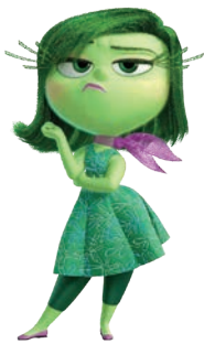
5. Disgust _____