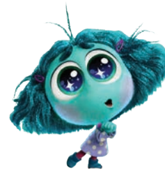
8. Envy _____