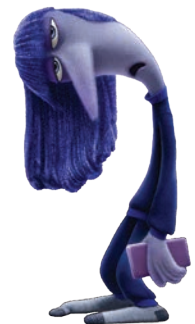
9. Ennui _____

Part 2 Riley feels many emotions — and so do we! Our feelings might also be different from someone else's feelings. For example, maybe having pizza for lunch makes one person happy. But someone else might feel disappointed or unhappy if they were hoping for something else. Now it's your turn. Read each sentence below. Fill in the blank to show how each situation makes you feel.