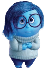
2. Sadness _____