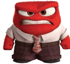
3. Anger _____