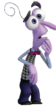
4. Fear _____