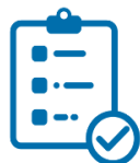
Disability tax credit