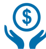
Working income tax benefit advance payments