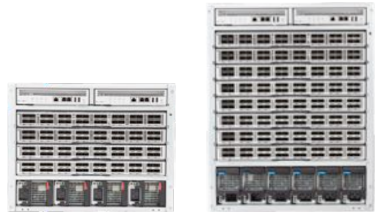
Arista 7300X Series Chassis

The midplane is completely passive and provides control plane connectivity to each of the fabric and line card modules. The system is optimized for data center deployments with front-to-rear and rear to front airflow options.