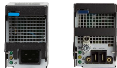
Arista 7300X Series Power Supplies

The AC power supplies are highly efficient in both platinum or titanium climate saver rated options and have an efficiency of over 93% with single stage conversion to the internal DC voltage. The DC power supplies require inputs at -48V DC to deliver up to 3000W. The 7300 Series uses multiple small power supplies which allows for incremental provisioning and smaller input circuits. Variable power supply fan speeds ensure power supply efficiency is optimized and reduces noise in data center environments.