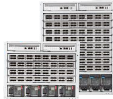
Arista 7300X Series Modular Data Center Switches

With reversible front-to-rear or rear-to-front airflow, redundant and hot swappable supervisor, power, fabric and cooling modules the system is purpose built for data centers. The 7300 Series is energy efficient with typical power consumption of under 3 watts per 10GbE port for a fully loaded chassis. All of these attributes make the Arista 7300 Series an ideal platform for building reliable, low latency, resilient and scalable data center networks. Combined with Arista EOS the 7300 Series delivers advanced features for big data, cloud, virtualized and traditional designs.